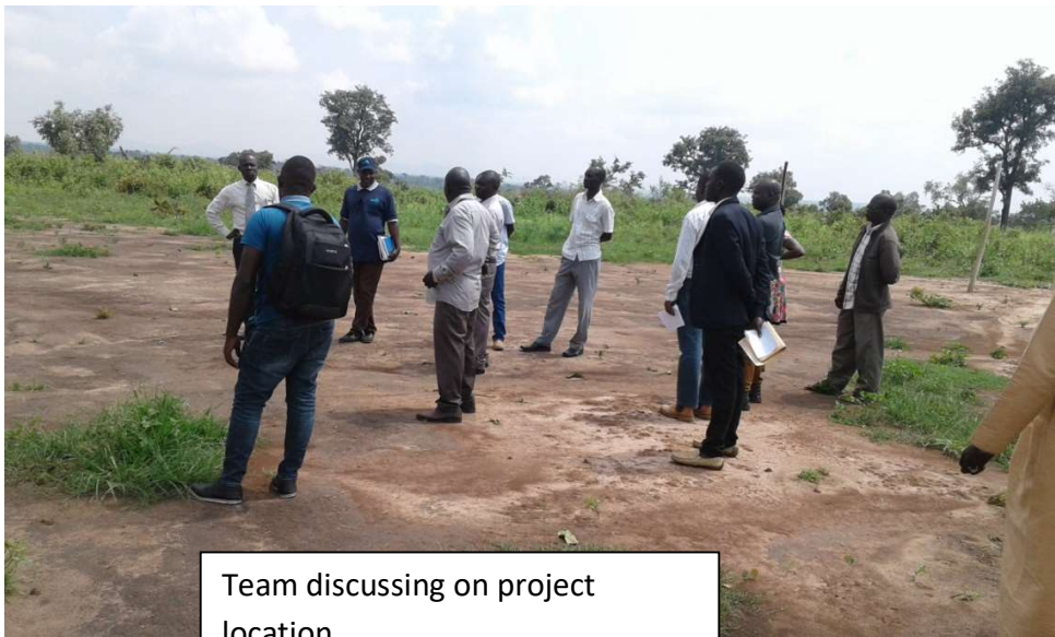
Team discussing on project location