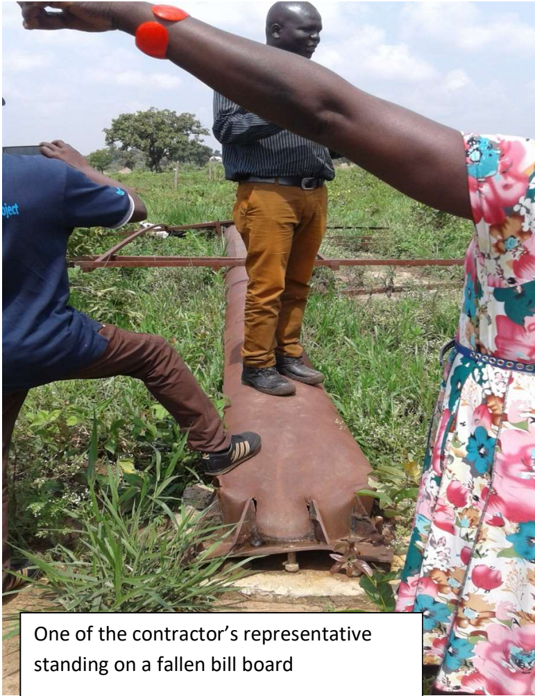
One of the contractor's representative standing on a fallen bill board